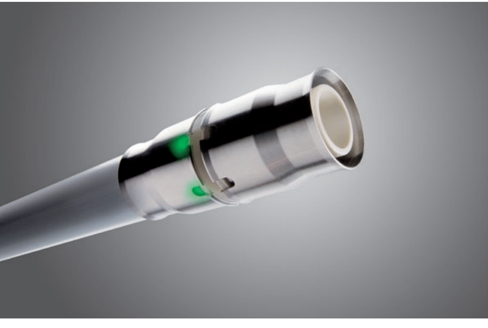
The innovative push-fit fitting in dimensions of 16, 20 and 26 mm